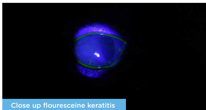
Close up flouresceine keratitis

Treatment of herpesvirus infection can be long-lasting and frustrating, as there is no cure for this infection. It is in the nature of the virus to persist throughout the host's