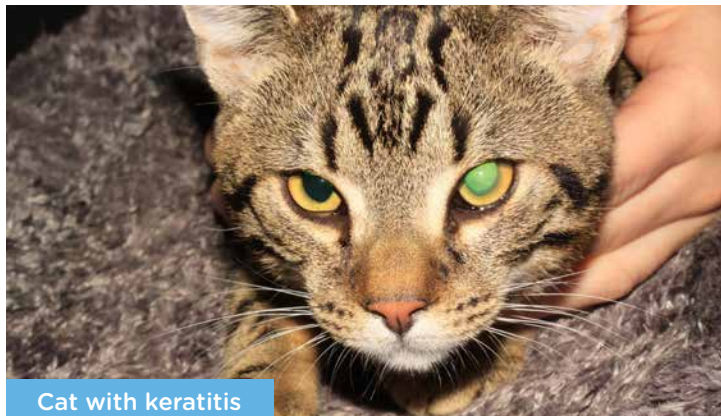
Cat with keratitis