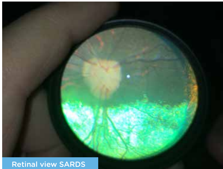
Retinal view SARDS